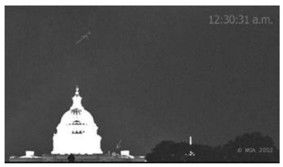
On July 16, 2002, a blue sphere-shaped UFO lands briefly on the Capitol Building roof (lower right of dome), then takes to the air.

He estimates that 20 minutes elapsed before he took the next and final shot of the evening. That image's exposure time was 3.5 minutes. Hovering in the sky, just above a commercial building, there are a number of UFOs, some grouped in a triangular formation. Near the ground there are two UFOs in the distance. However, floating in the air in front of the DC photographer, there are two oval-shaped, semi-transparent spheres of energy that he believes were UFOs equipped with some type of advanced optical stealth device. The amount of alien activity that took place that night was mind-boggling.